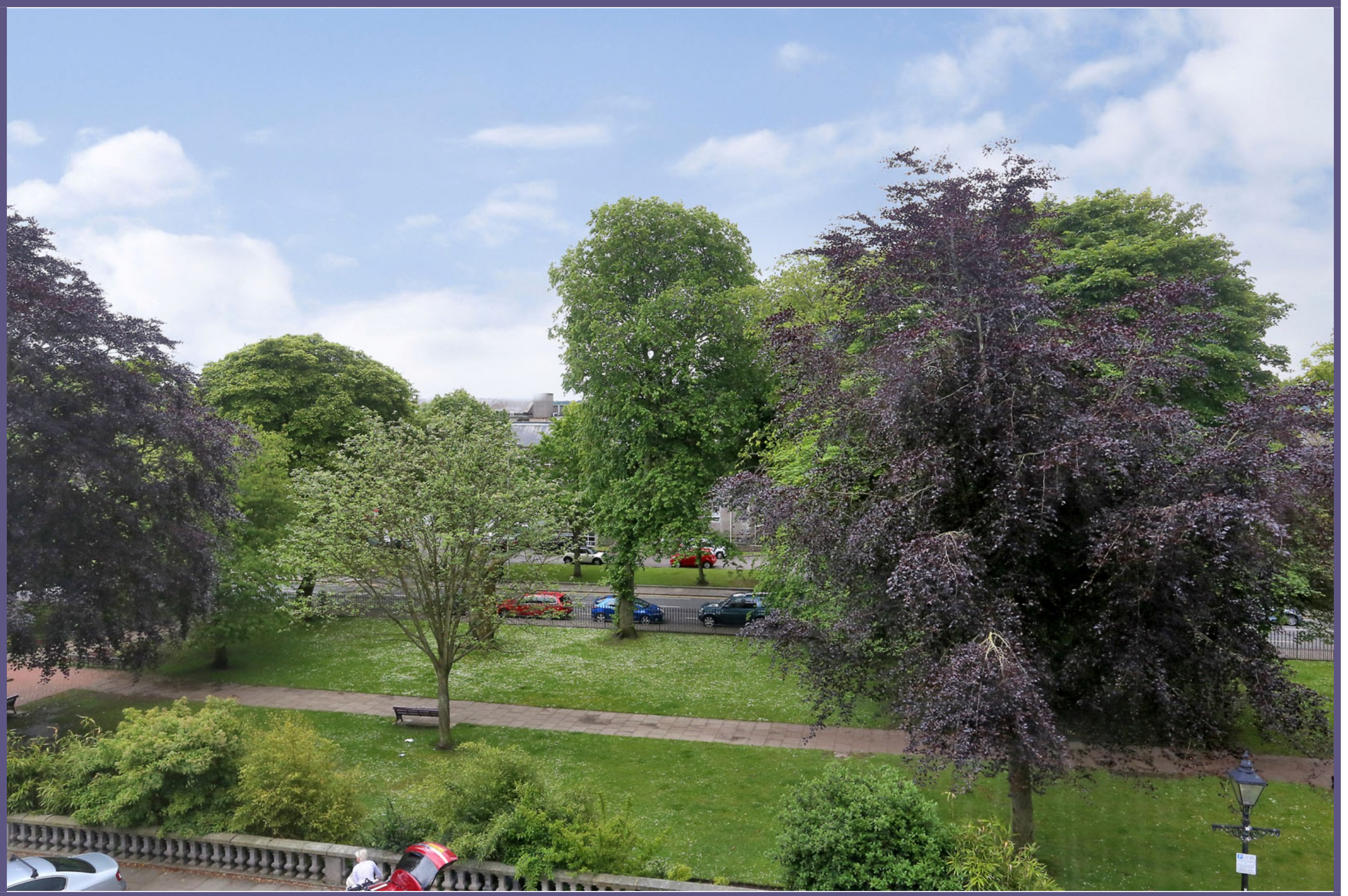
View from Lounge