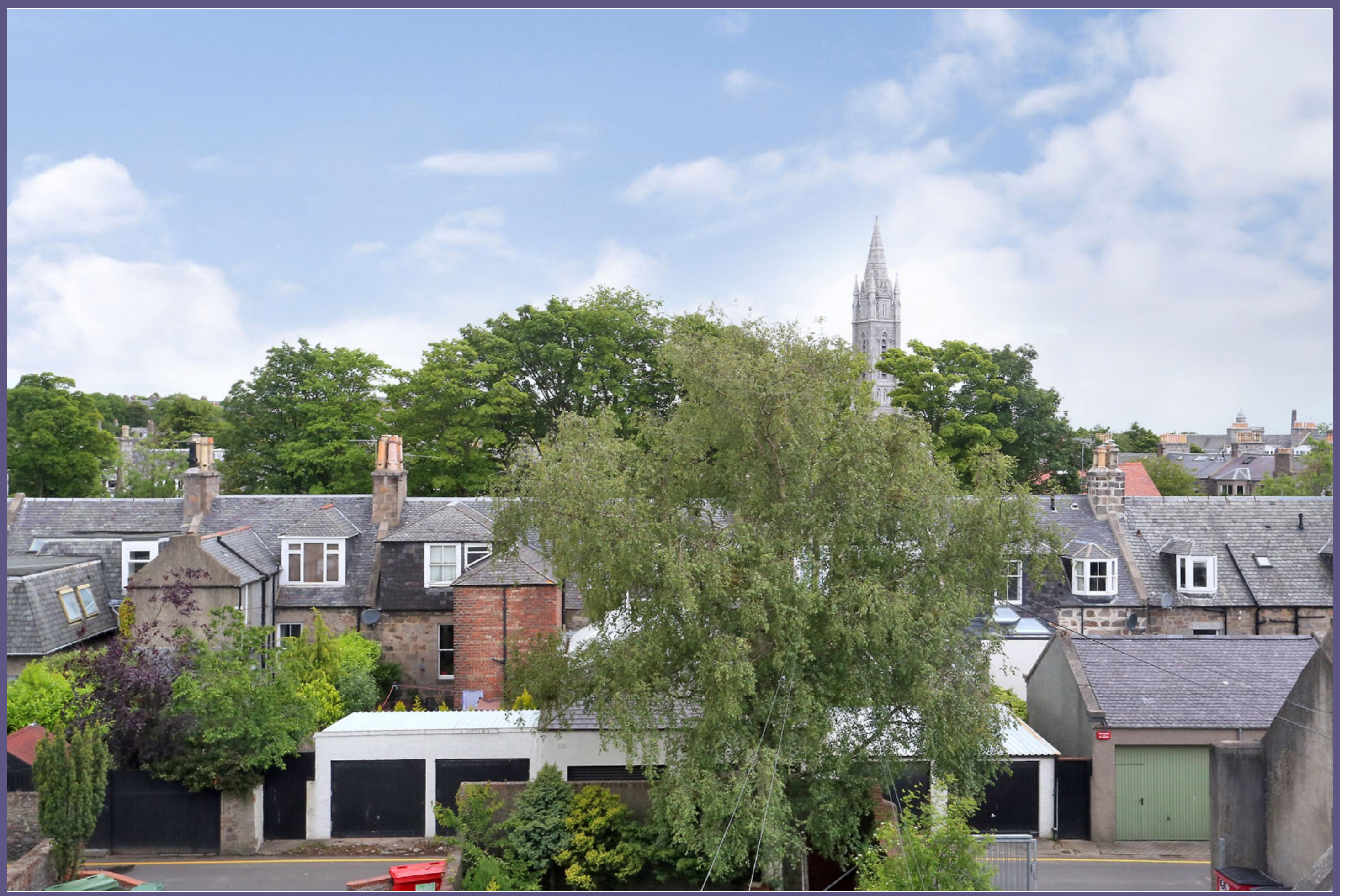
View from Bedroom